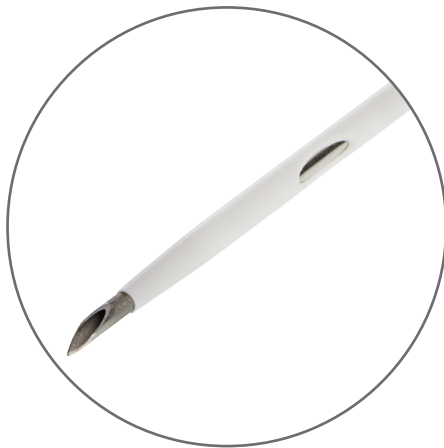
Smooth needle/catheter transition